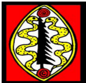
Aboriginal Legal Rights Movement Inc