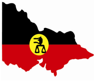
Victorian Aboriginal Legal Service Co-operative Ltd