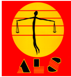
Aboriginal Legal Service of Western Australia